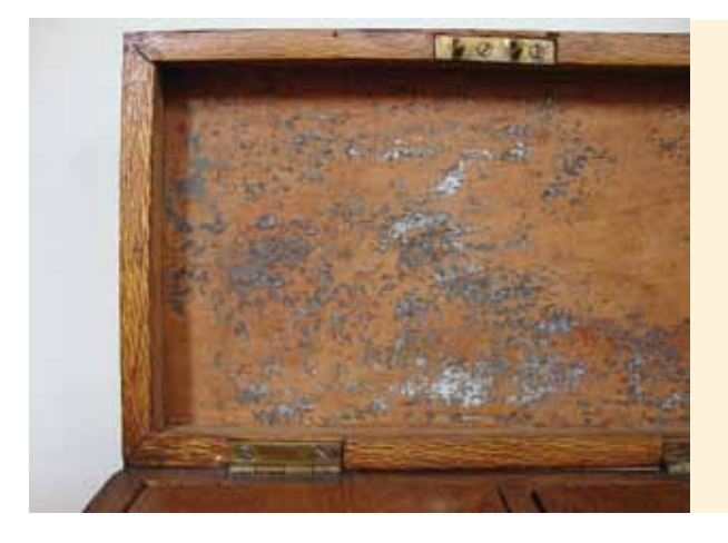
3-5 Tea caddy, beefwood, pine, NSW origin, c 1825. H 13.5 cm. This is the earliest known Australian tea caddy. Private collection